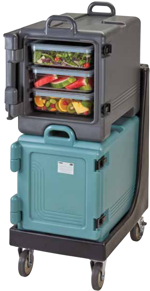
FOOD PAN CAPACITY